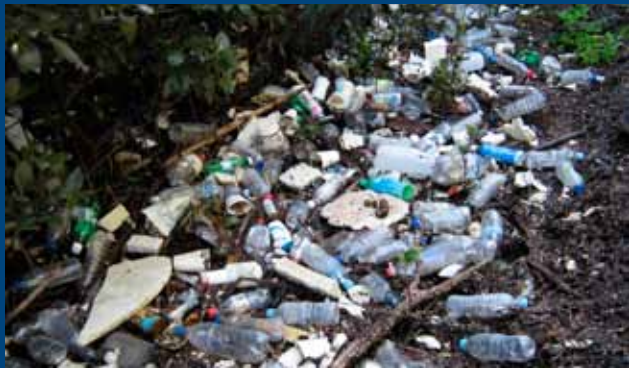
Litter at the high tide mark; everyone can help to prevent this.

As we come to realise the limits that these environments can tolerate, and how close we are to those limits, it becomes essential for each of us to follow the best possible environmental practices in using and maintaining our boats on and around the water.