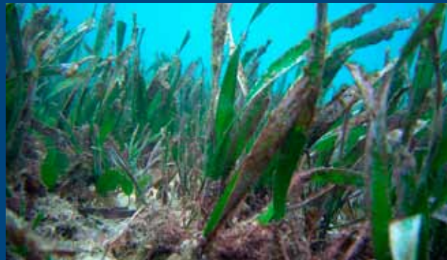
Take care near seagrass beds as they are important fish habitats and can easily be damaged.